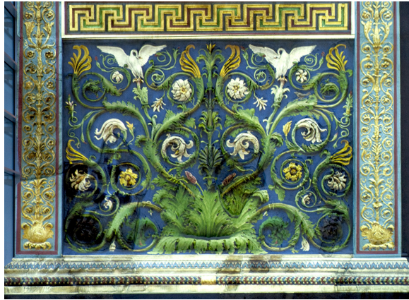
Detail of the Ara Pacis Augustae