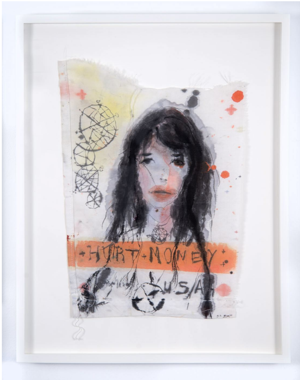
BRAD KAHLHAMER Hurt Money , 2010 acrylic, ink, and spray paint, on bed sheet 16 x 10 inches 21 5/8 x 16 11/16 x 1 1/2 inches framed initialed and dated on front Inventory #BRK10.002