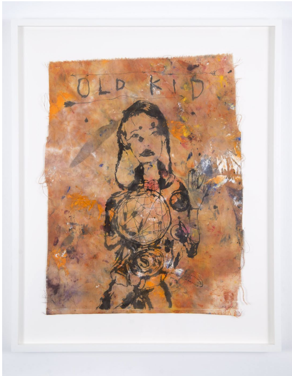
BRAD KAHLHAMER Old Kid , 2011 acrylic, ink, and spray paint, on bed sheet 19 1/2 x 14 1/2 inches 25 1/4 x 20 1/2 x 1 1/2 inches framed initialed and dated on front Inventory #BRK11.003