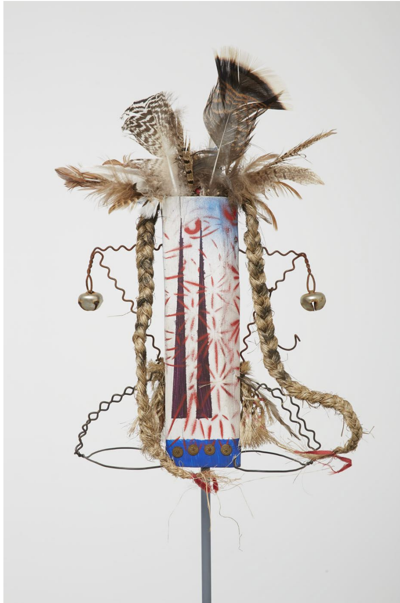
BRAD KAHLHAMER Next Level Figure 3 , 2013 wood, wire, rope, feathers, bells, acrylic and spray paint sculpture: 13 1/2 x 8 1/2 x 4 1/2 inches installed on metal stand: 58 x 8 1/2 x 5 1/2 inches Inventory #BRK13.021