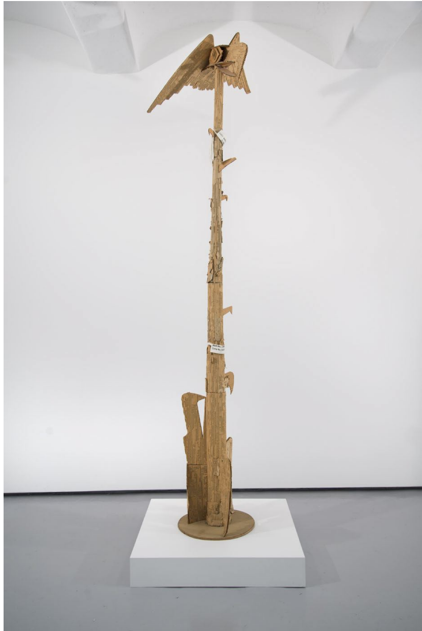
BRAD KAHLHAMER Waqui Totem Urban Class Mark 5, Study , 2007 cardboard 116 x 31 x 34 inches Inventory #BRK07.004