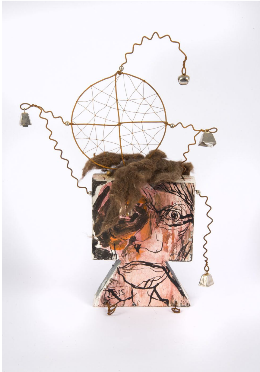
BRAD KAHLHAMER Next Level Figure 28, 2014 wood, wire, fur, bells, acrylic and spray paint sculpture: 14 x 11 x 4 1/2 inches installed on metal stand: 62 x 11 x 5 inches initialed and dated Inventory #BRK14.023