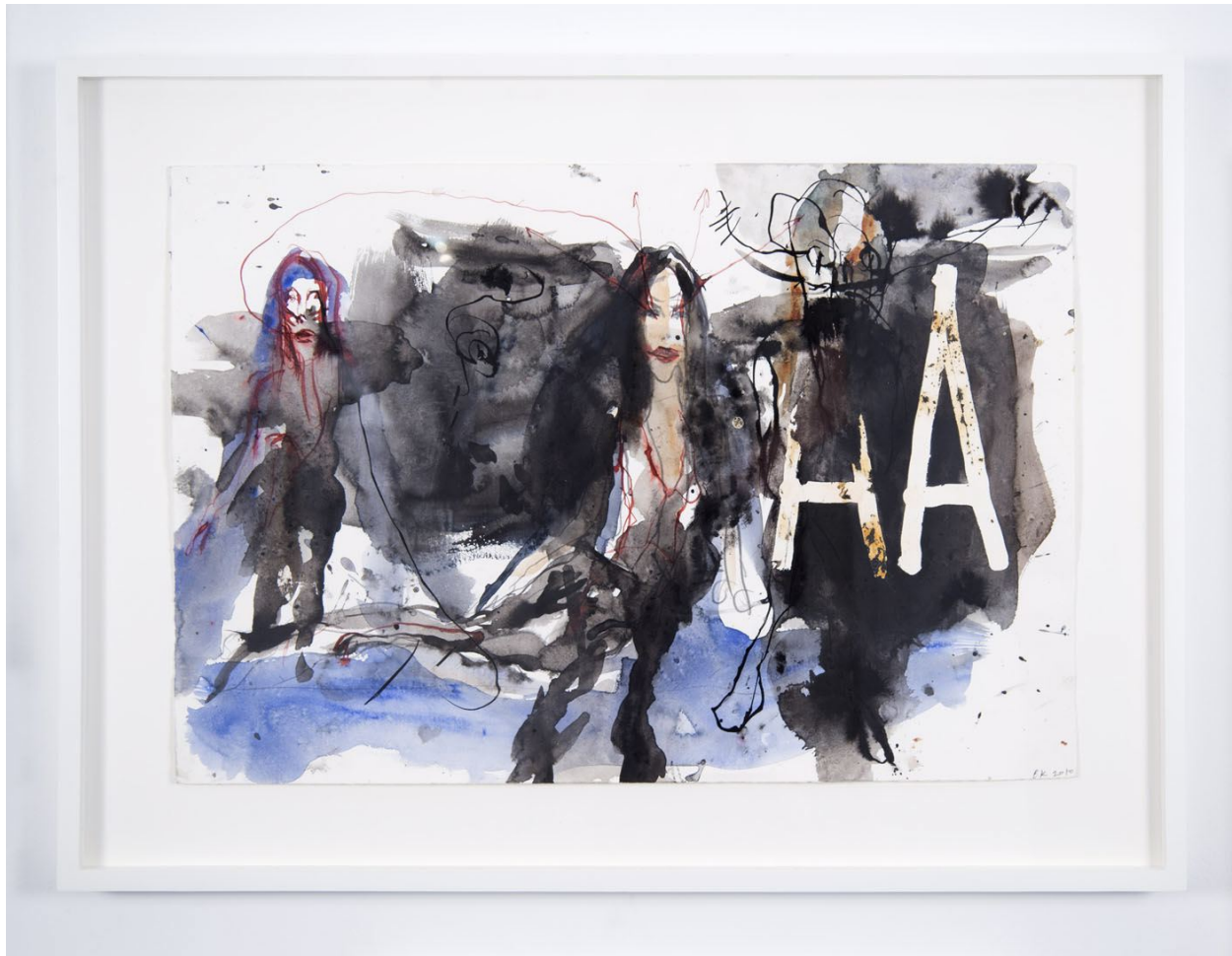
BRAD KAHLHAMER Ha , 2010 watercolor on paper 15 x 21 1/2 inches 20 1/8 x 27 1/8 x 1 1/2 inches framed initialed and dated on front Inventory #BRK10.003