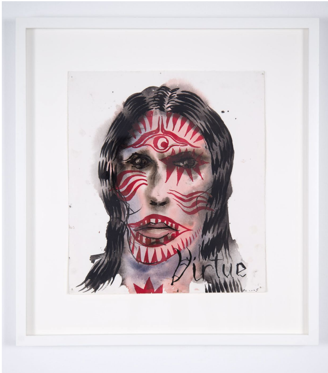
BRAD KAHLHAMER Virtue , 2005 watercolor on paper 11 x 10 inches 16 1/16 x 15 3/16 x 1 1/2 inches framed signed, titled, and dated on verso Inventory #BRK05.004