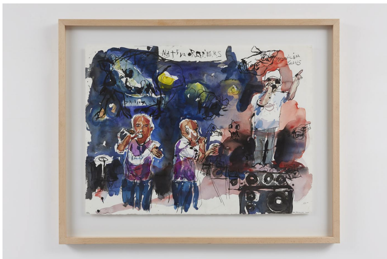
BRAD KAHLHAMER Native Rappers , 2002 watercolor on paper 22 x 29 1/2 inches 29 1/2 x 36 3/4 inches (framed) signed and dated on front Inventory #BRK02.001