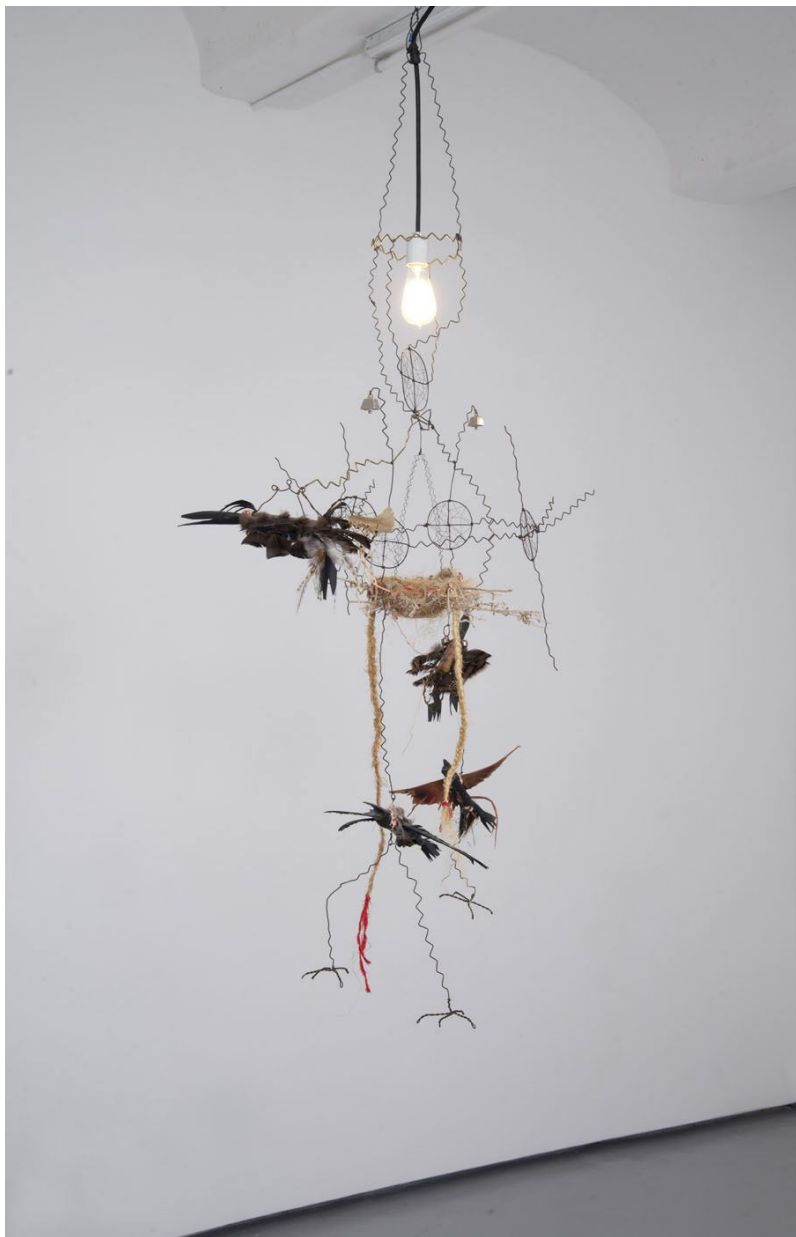
BRAD KAHLHAMER Chandelier Nest , 2013 mixed media, wire, feathers, rope, cloth, and bells 54 x 39 x 20 inches (dimensions variable) Inventory #BRK13.014