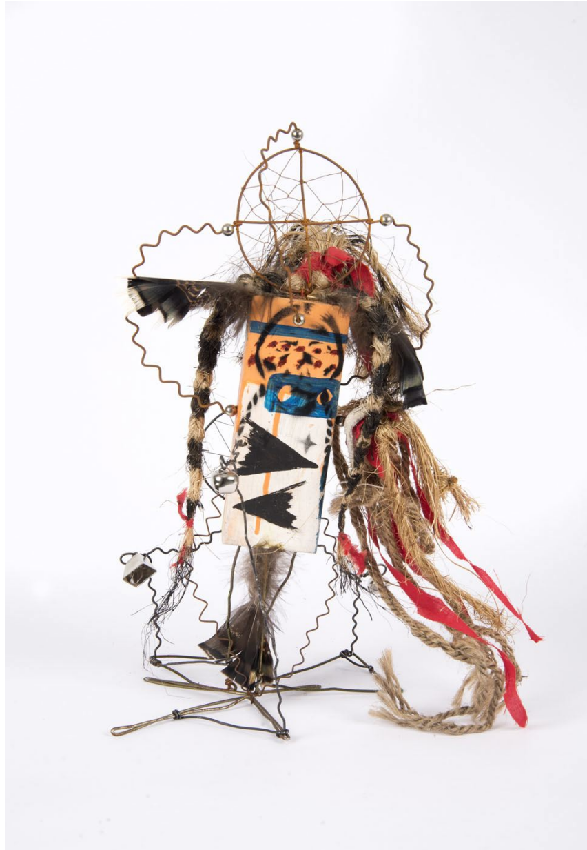
BRAD KAHLHAMER Next Level Figure 44, 2014 wood, wire, rope, feathers, bells, acrylic and spray paint sculpture: 16 x 8 x 6 inches installed on metal stand: 64 x 8 x 6 inches initialed and dated Inventory #BRK14.039