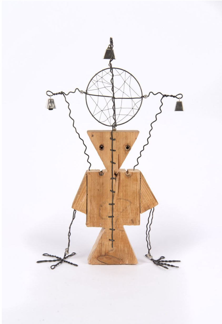
BRAD KAHLHAMER Next Level Figure 29 , 2014 wood, wire, and bells sculpture: 14 x 9 x 3 1/4 inches installed on metal stand: 56 1/4 x 9 x 5 inches initialed and dated Inventory #BRK14.024