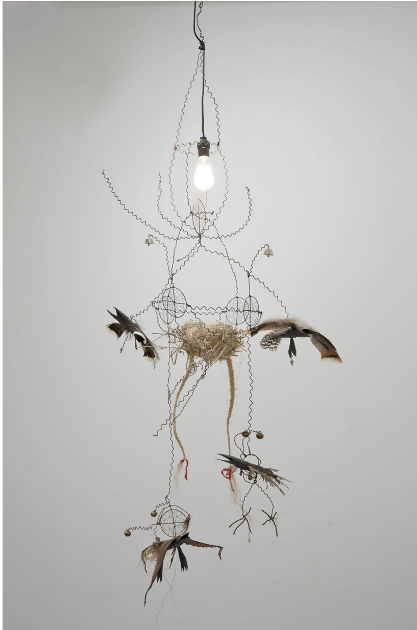
BRAD KAHLHAMER Chandelier Nest , 2013 mixed media, wire, feathers, rope, cloth, and bells 65 x 28 x 11 inches (dimensions variable) Inventory #BRK13.015