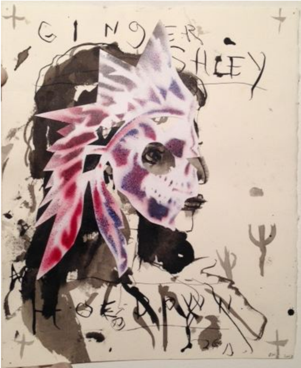
BRAD KAHLHAMER Ginger , 2012 spray paint and ink on paper 12 x 10 inches Inventory #BRK12.002