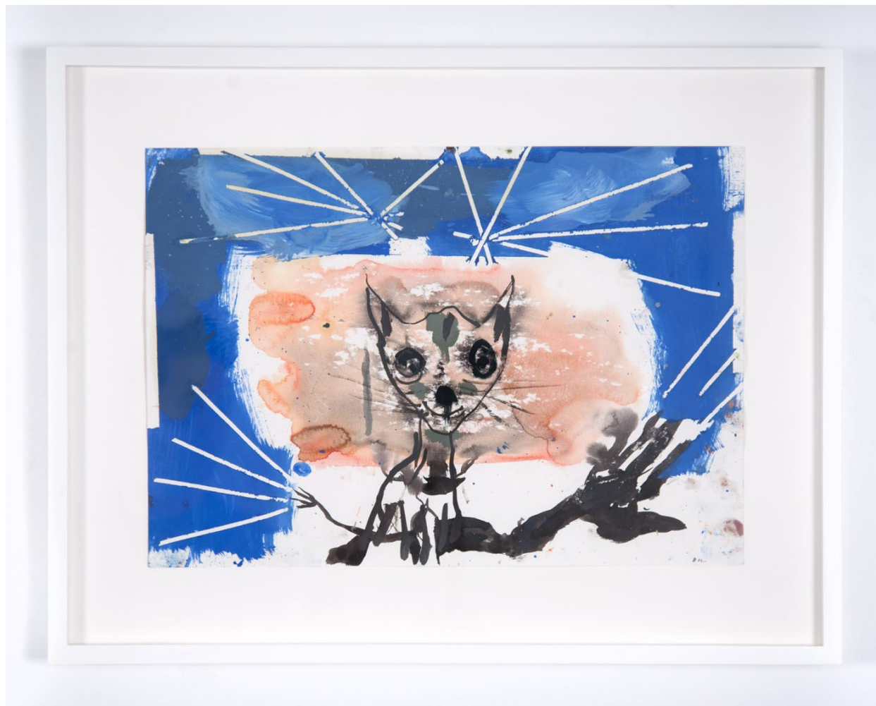
BRAD KAHLHAMER Boy in Giverny, 2009 oil and watercolor on paper 11 5/8 x 16 3/8 inches 16 3/4 x 21 5/8 x 1 1/2 inches signed, titled, and dated on verso Inventory #BRK09.003