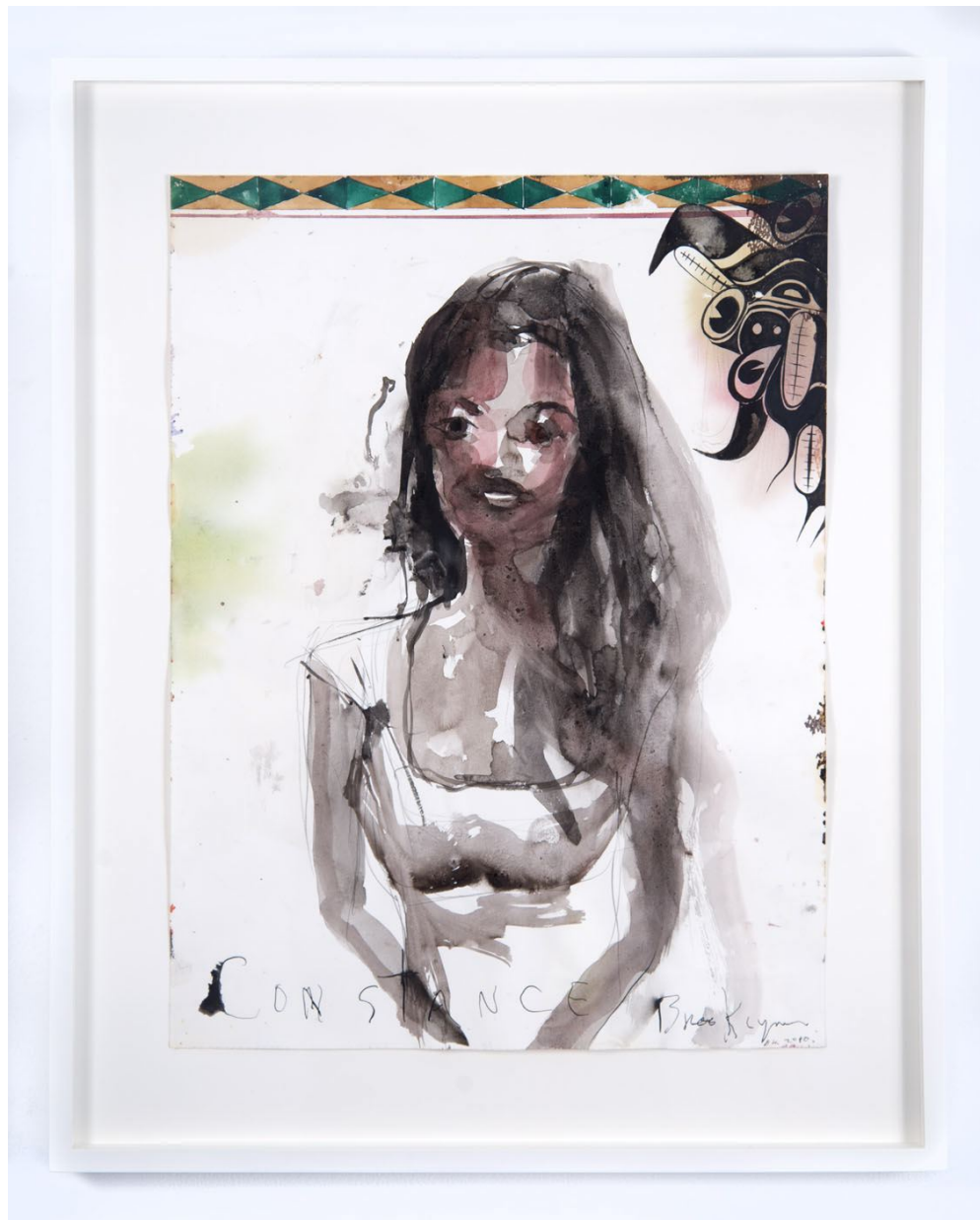
BRAD KAHLHAMER Constance , 2010 ink and watercolor on paper 20 x 15 inches 25 x 20 x 1 1/2 inches framed signed, titled, and dated on verso Inventory #BRK10.005