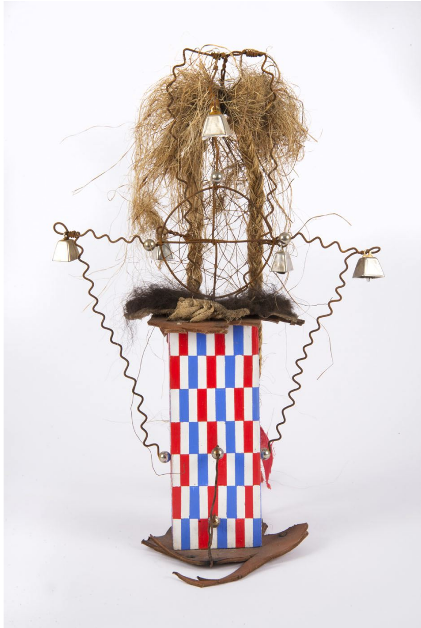
BRAD KAHLHAMER Next Level Figure 21, 2014 wood, wire, rope, fur, leather, bells, and acrylic paint sculpture: 16 x 11 x 13 inches installed on metal stand: 57 x 11 x 13 inches initialed and dated Inventory #BRK14.016