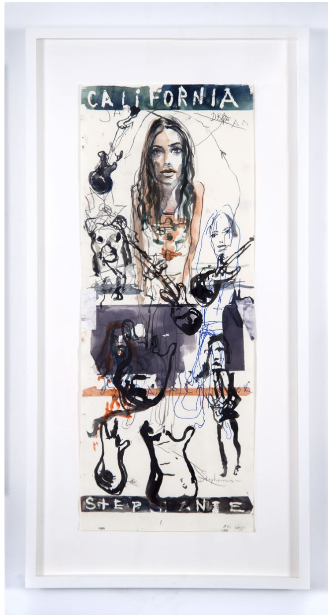
BRAD KAHLHAMER California Stephanie , 2011 watercolor, ink, and tape on paper 21 1/2 x 8 1/2 inches 26 7/8 x 13 5/8 x 1 1/2 inches framed initialed and dated on front Inventory #BRK11.005