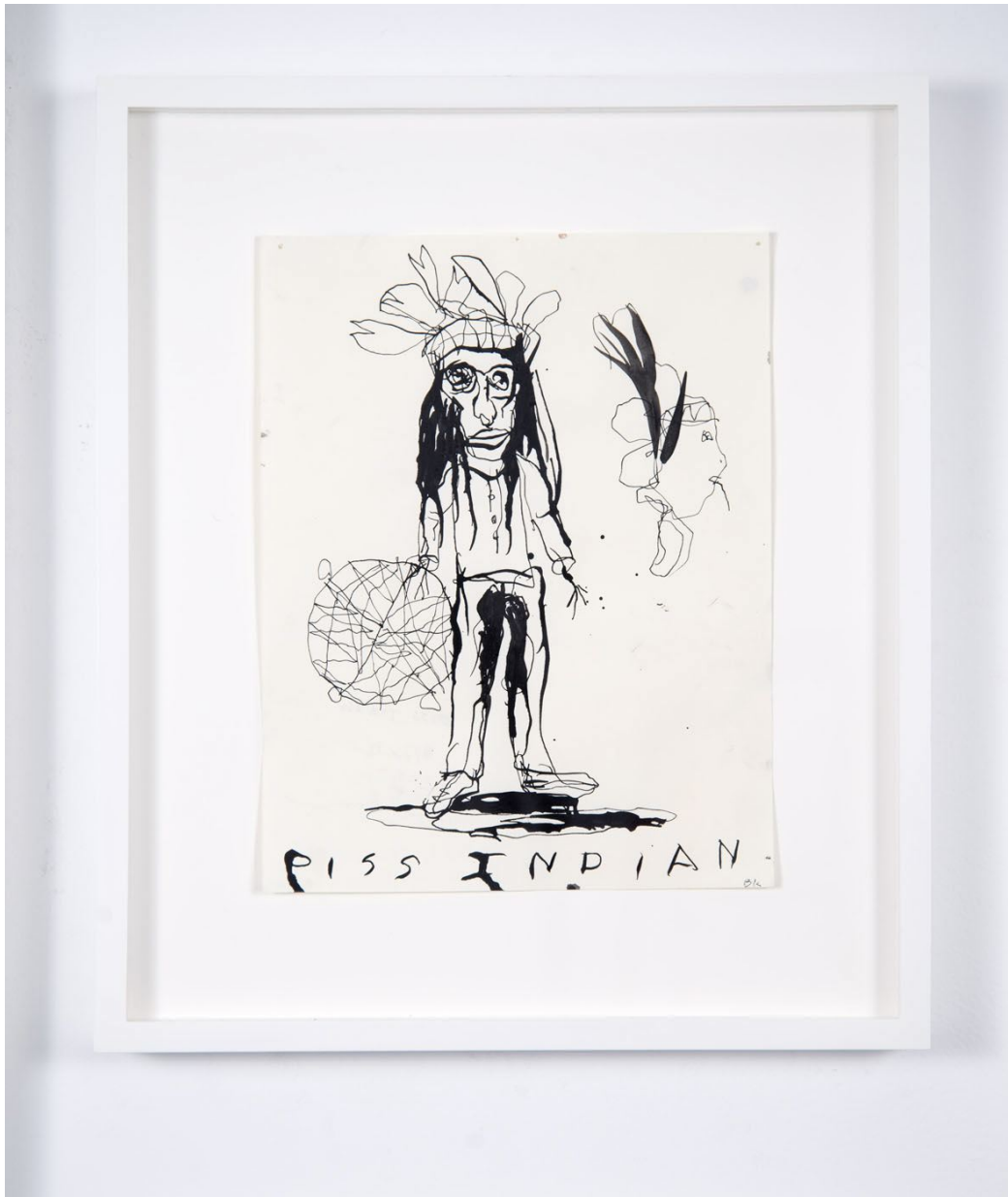
BRAD KAHLHAMER Piss Indian , 2011 ink on paper 12 x 8 1/2 inches 16 x 15 5/8 x 1 1/2 inches framed signed, titled, and dated on verso Inventory #BRK11.004