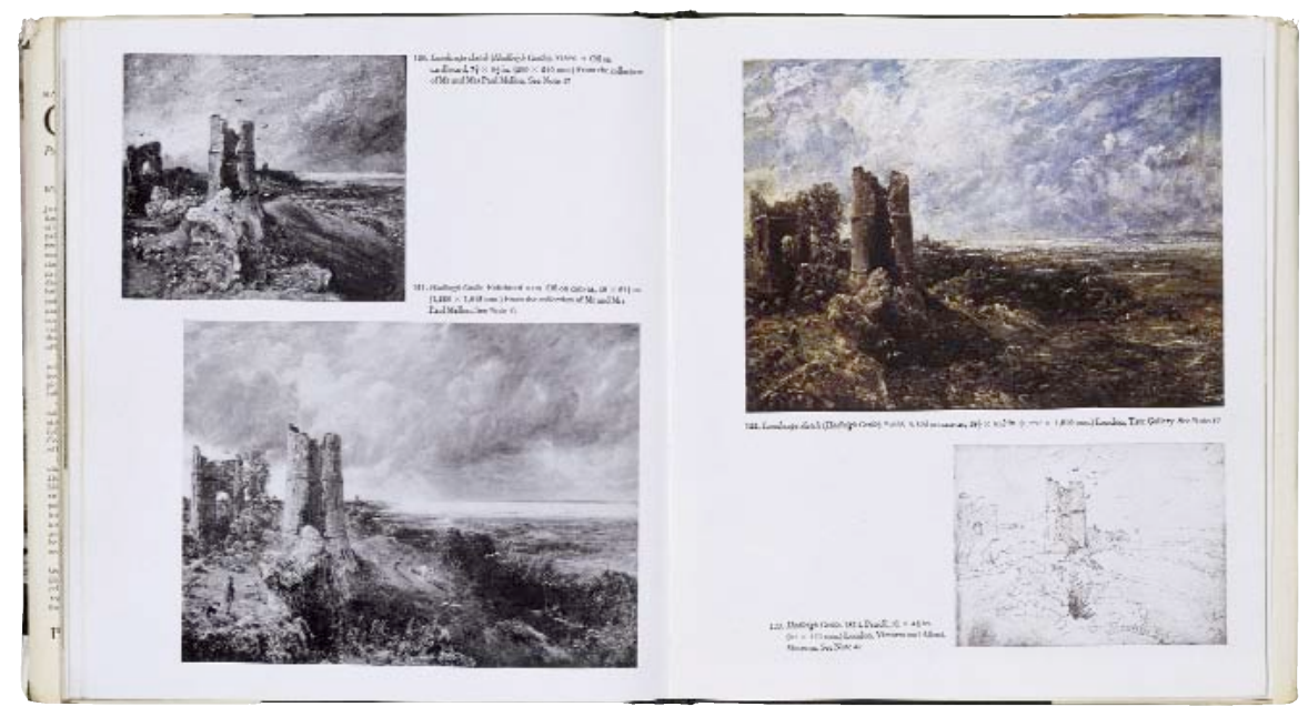
Figure 26 Related sketches for Hadleigh Castle (see nos.53-7) from Basil Taylor, Constable: Paintings, Drawings and Watercolours, London 1973, figs.120-3