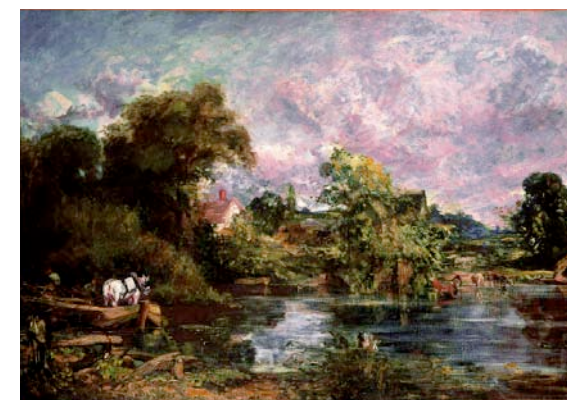
FIGURE 18 FIGURE 19