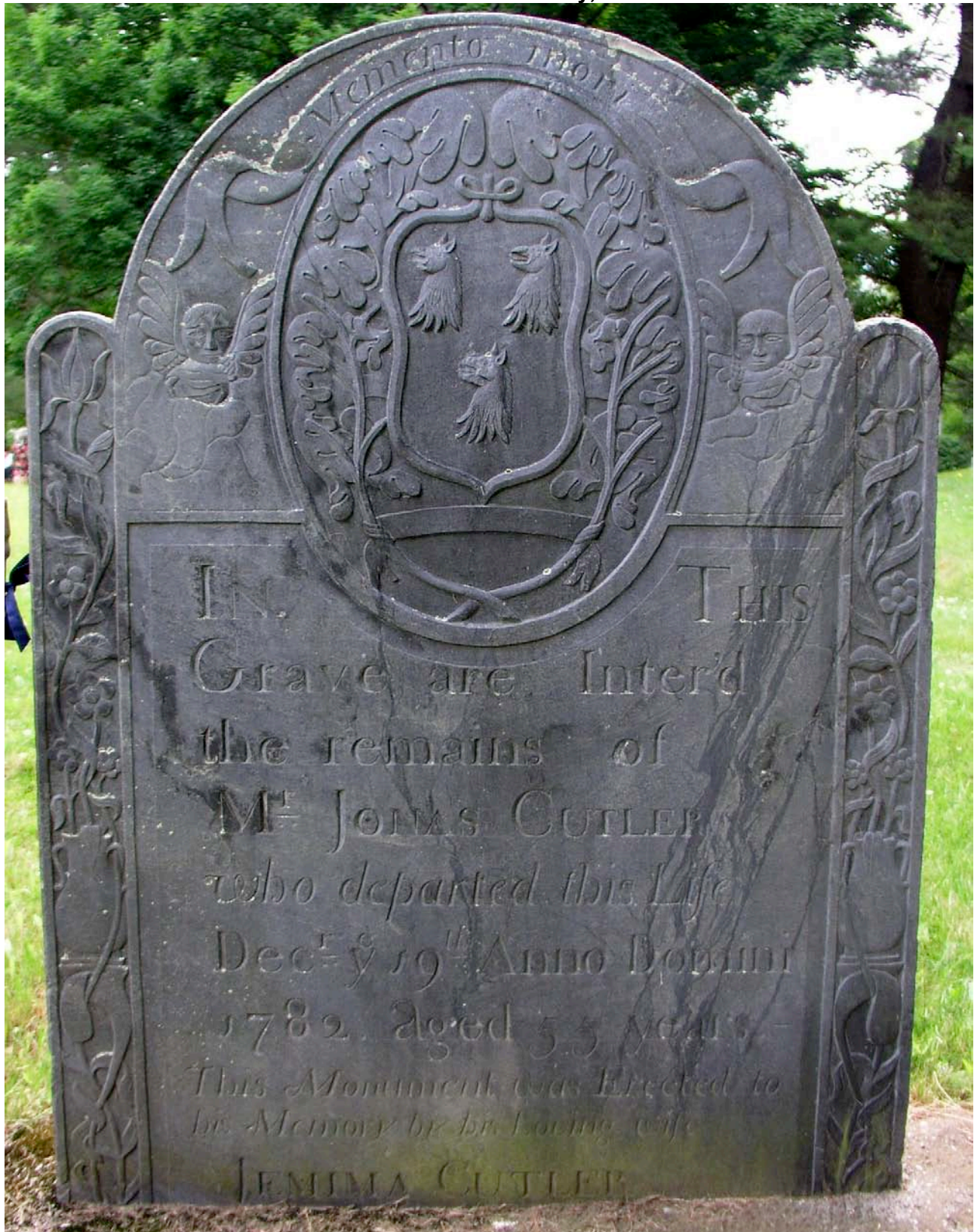
Stone 1: Groton Cemetery, MA