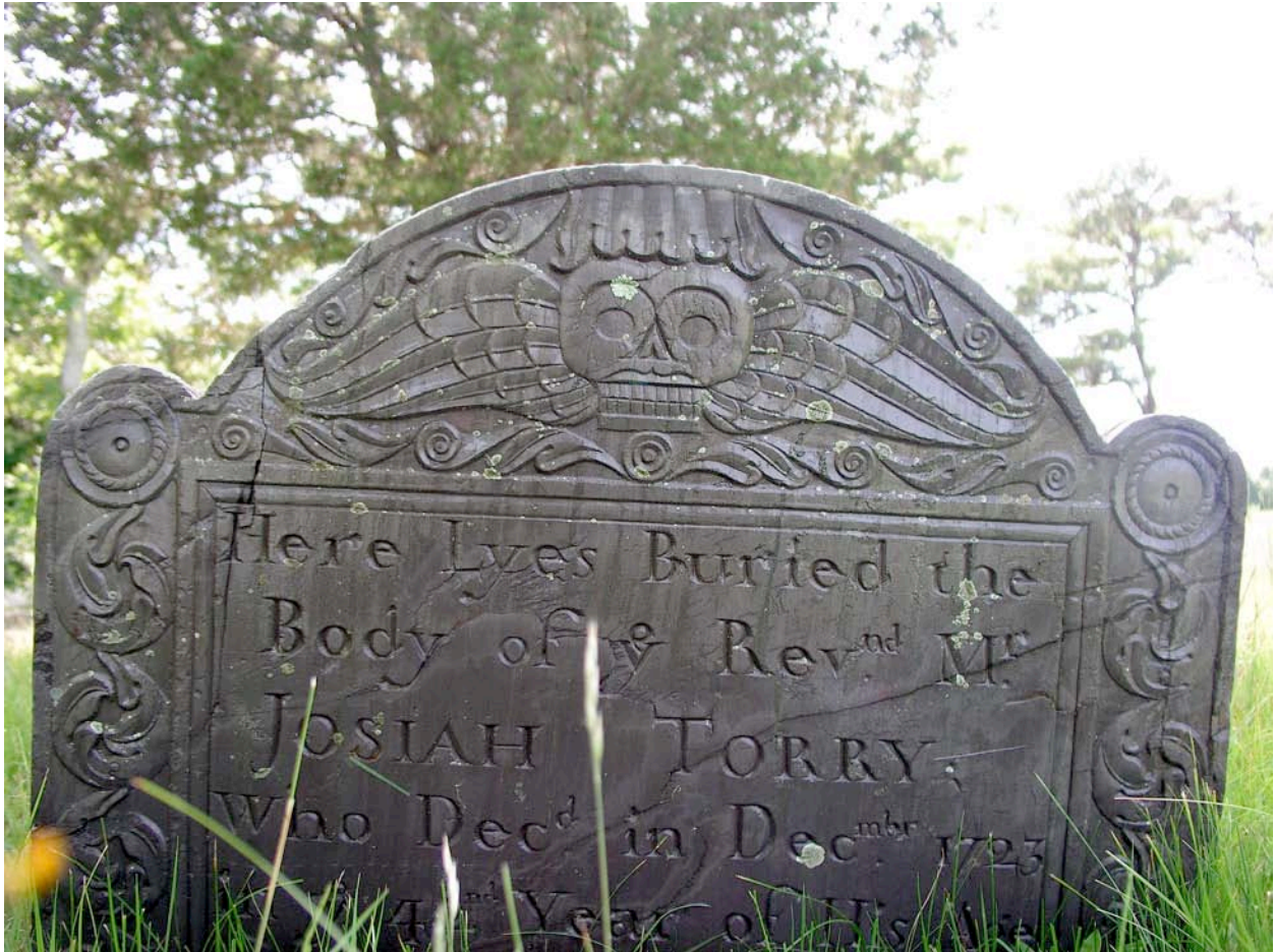
Stone #7: West Tisbury Village Cemetery, Martha's Vineyard, MA