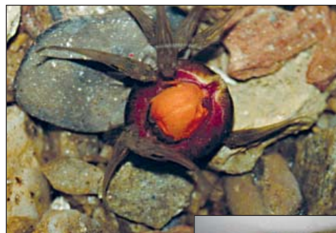
Yum. Orange fruit (above) and fruit-colored spots (right) catch a guppy’s eye.