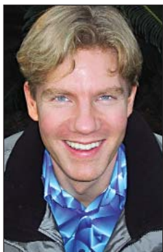
Lightning rod. Bjørn Lomborg’s new job has sparked furor.

COPENHAGEN —Has the Danish government put a fox in charge of the henhouse? That’s what many environmental researchers are wondering after last week’s appointment of Bjørn Lomborg, author of the controversial book The Skeptical Environmentalist , as director of Denmark’s new national Institute for Environmental Evaluation.