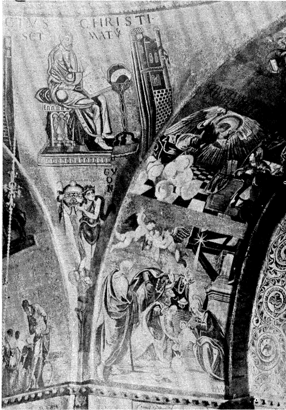
FIGURE 1. One of the four spandrels of St Mark's; seated evangelist above, personification of river below.

The design is so elaborate, harmonious and purposeful that we are tempted to view it as the starting point of any analysis, as the cause in some sense of the surrounding architecture. But this would invert the proper path of analysis. The