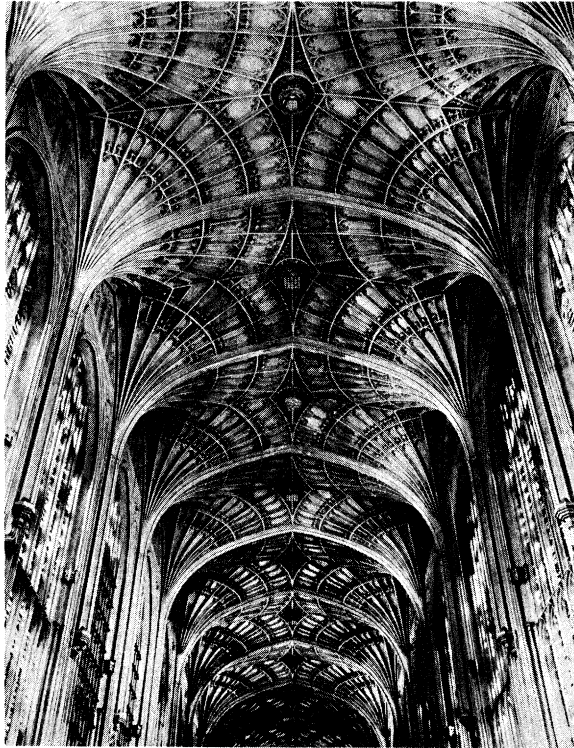
FIGURE 2. The ceiling of King's College Chapel.

the Tudor rose and portcullis. In a sense, this design represents an ‘adaptation’, but the architectural constraint is clearly primary. The spaces arise as a necessary by-product of fan vaulting; their appropriate use is a secondary effect. Anyone who tried to argue that the structure exists because the alternation of rose and portcullis makes so much sense in a Tudor chapel would be inviting the same ridicule that Voltaire heaped on Dr Pangloss: ‘Things cannot be other than they